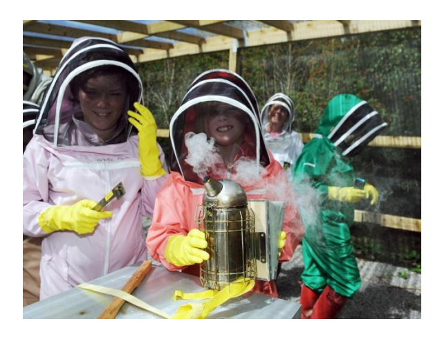
It turned into a very "hands-on" visit