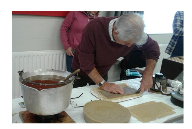
Trimming the edges of the sheet of foundation