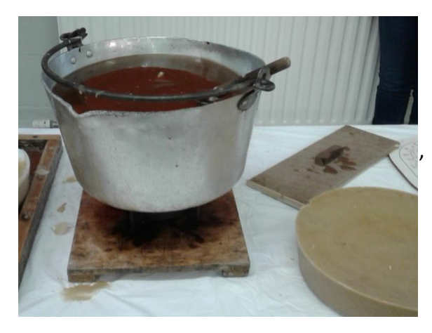
Beeswax melting over water